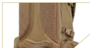
AIR-FLOW BACK SUPPORT