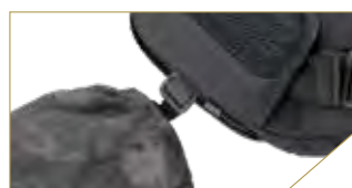
HIDDEN RAIN COVER