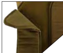
AIR-FLOW BACK PADDING