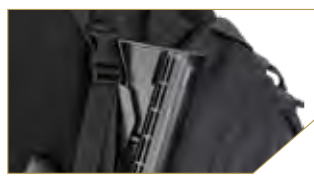
INTEGRATED SLING BUCKLE