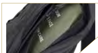
10" x 12" PLATE POCKET